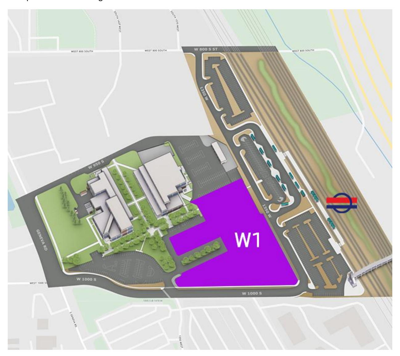
UVU West Campus - 951 S Geneva Rd, Orem, UT 84058

Convenience parking is available in the lot designated W1 at UVU West Campus, located on the West side of I-15 and adjacent to UTA Frontrunner Orem Central Station. The UVU pedestrian Bridge between Main Campus and West Campus is open year-round for pedestrian, bicycle, and scooters. UTA Bus and UVX services are available to transport guests from UVU West Campus to UVU Main Campus. (see page 4.) UVX runs every 6-15 minutes, is free of charge for all riders and stops first at UVU Main campus. Parking at UVU West Campus provides additional opportunity for easy parking and transportation for event guests.